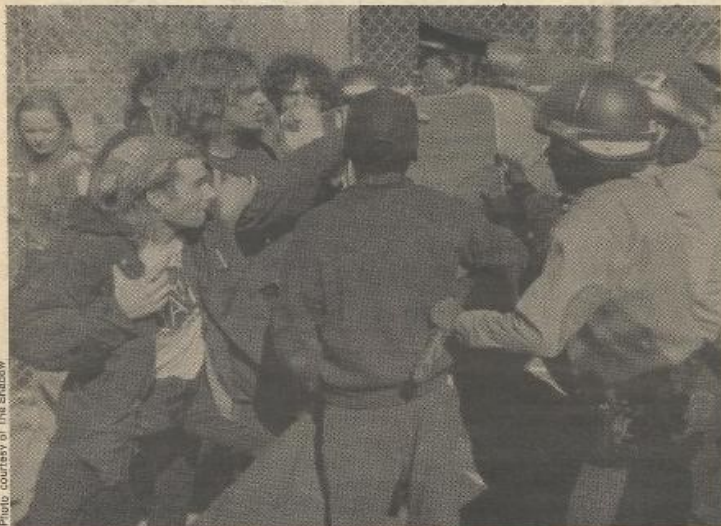
Squatters fight with cops outside ABC community center