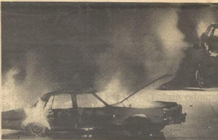
Miami Rebellion, January 1989

It's too bad that he's not alive to continue the struggle. I often wonder if he would have supported the liberation of women, gays and lesbians today. I think we should remember the total political character of Malcolm X, and should strive to build the Black liberation struggle with an anti-authoritarian strategy. ★