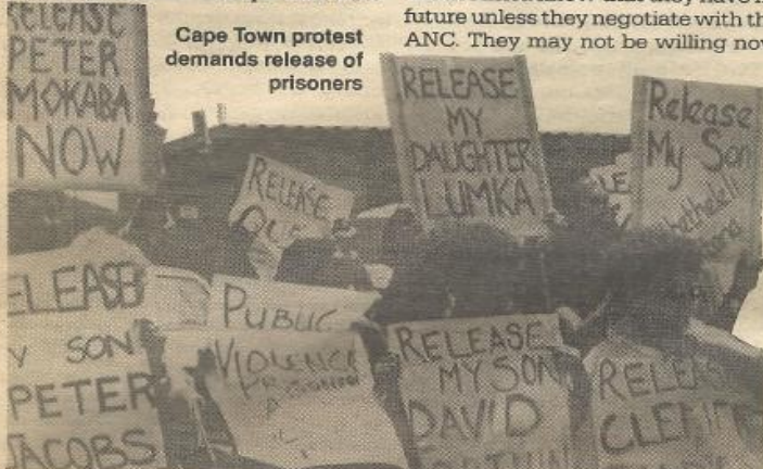
Cape Town protest demands release of prisoners

Love and Rage is a monthly anarchist newspaper intended to foster revolutionary anti-authoritarian activism in North America. We will provide coverage of social struggles, world events, anarchist actions and cultures of resistance. We will support the struggles of oppressed people around the world for control over their own lives. Anarchy offers the broadest possible critique of domination, making possible a framework for unity in all struggles for liberation. We seek to understand the systems we live under for ourselves and reject any prepackaged ideology. Anarchism is a living body of theory and practice connected directly to the lived experiences of oppressed people fighting for their own liberation. We anticipate the constant and radical revision of our ideas as a necessary part of any revolutionary process.