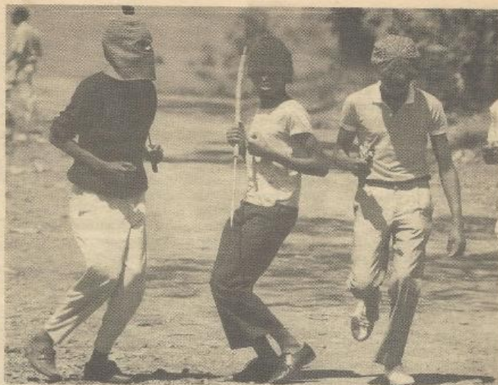
Camaradas en Sudáfrica

En el preciso instante en que Mandela estaba siendo liberado de prisión, jóvenes negros saqueaban las tiendas del centro de la ciudad de Cape Town. El CNA se unió al régimen del apartheid para denunciarlos. Al finalizar su discurso de 25 minutos, Mandela les pidió a todos los participantes de la manifestación que lo recibían, que al dispersarse lo hicieran sin hacer nada que "llevara a otros a decir que nosotros no podemos controlar a nuestra propia gente." Estos incidentes resumen muchas de las cosas que actualmente ocurren en Sudáfrica. La gente de las aldeas está lista para la revolución. Ellos poseen años y años de autoorganización mientras que los líderes estrellas del CNA han intentado de controlar el movimiento desde el exilio. La carta de triunfo del CNA en la mesa de negociaciones consiste en su capacidad para "controlar a su propia gente." Si no lo pueden hacer, los blancos dominantes no tendrán a nadie con quien negociar. Una transferencia negociada del poder podría muy bien significar grandes ganancias para ciertos sectores de los blancos capitalistas. El desmantelamiento ordenado del apartheid podría originar una verdadera clase media negra y consecuentemente la creación de nuevos mercados internos para las mercancías sudafricanas. Tony Bloom, el Donald Trump africano, ha llamado consecuentemente la atención sobre estas ganancias